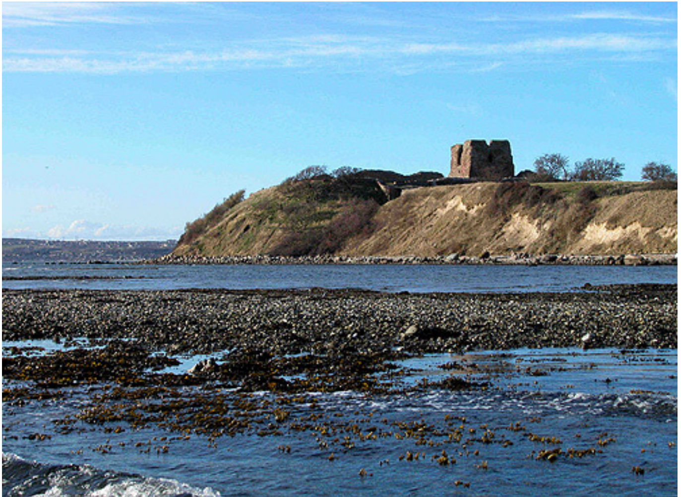
Kalø-ruinens tårn og ringmur set fra sydøst.

The royal castle at Kalø at the bottom of Aarhus Bay and Kalø Vig is one of our best-preserved medieval castles.