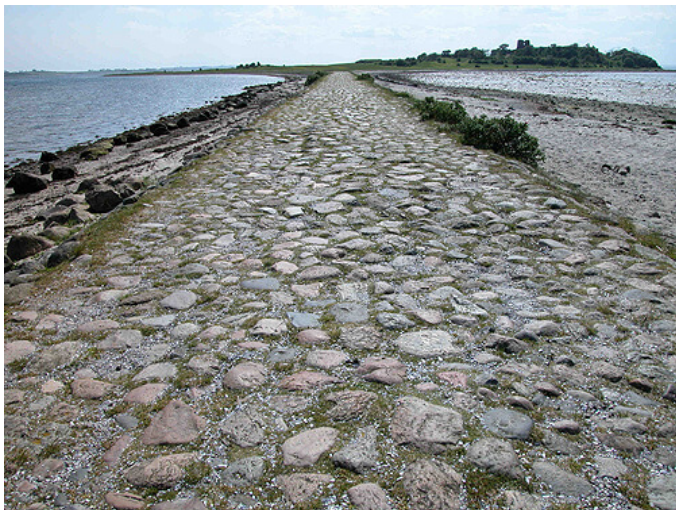
Den stenbrolagte og 500 m. lange vejdæmning til Kaløborgen set fra nord.