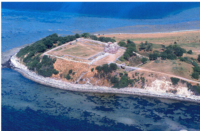
Luftfoto af Kalø-borgen set fra syd.

LINK: See reconstruction of Kalø Castle.