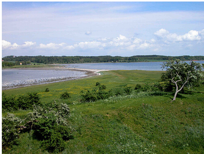
Udsigt over vejdæmningen mod nordøst set fra borgen.